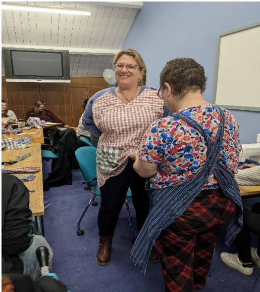
The group at Emmaus Bolton in action creating their own aprons.

This upcycling and textiles project funded by Bolton's Fund is on going and takes place at Emmaus Bolton on Tuesday mornings 11am-1pm. If you would like more information, please contact us or keep an eye on Eventbrite for new openings in the course.